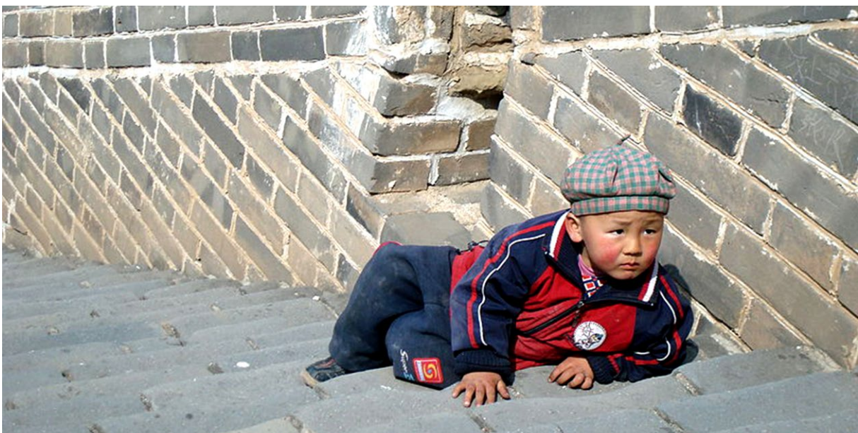
Boy on the Great Wall.

continuity and change, modernisation, sustainability, tradition, beliefs and values, empowerment, westernisation, cooperation and conflict